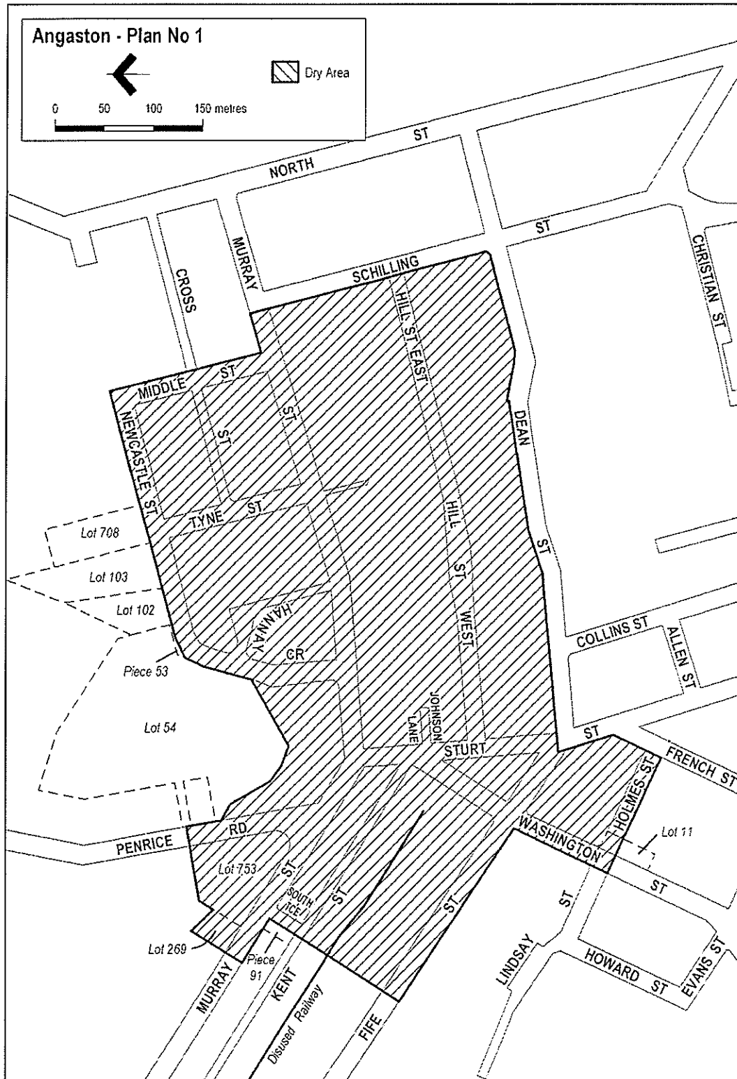
Map 1 of 2

From 10:00pm to 8:00am on all days the consumption of alcohol and possession of open containers of alcohol is prohibited in the Dry Area as shown in Angaston - Plan No 1 and Angaston - Plan No 2.