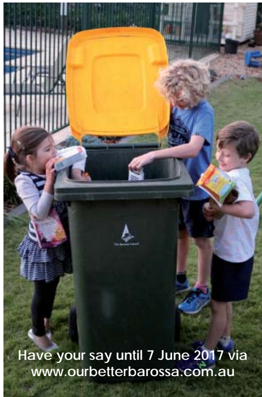
Have your say until 7 June 2017 via www.ourbetterbarossa.com.au