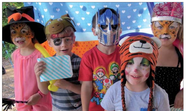
Creative costumes were in abundance at the Friends of Barossa Library Storybook Picnic which attracted 350 people.

From this week ratepayers will receive a discount card in the post which provides a 10 per cent discount on any once-off service (conditions apply). The card is transferable and can be handed on to family and friends who are not Barossa residents.