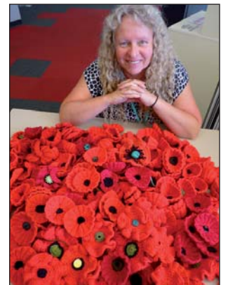
A sea of poppies handmade by members of the community have been dispatched to Melbourne for the '5000 Poppies' Project.